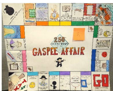
First Place Winner 2022

5th grade students interested in the American Revolution to participate. The contest is open to public school, parochial, home schooled, Scouting, or Children of the American Revolution members in that same grade range. Young artists with an enthusiasm toward art, a love of American history, or a passion in creative expression can submit their posters to their local SAR Chapter for competition. While the Americanism Poster Contest begins at the local level, students' masterpieces may eventually be judged and monetarily awarded at the national level in June at the annual SAR Congress.